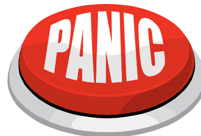
chart auditing, billing and coding, human resource organization, and more. You can visit our website just by clicking on the "Panic" button to your right! Let us help you today!

Does the thought of auditing your charts send you running for the panic button? Don't worry— MD Alliance Billing, LLC , can help you through the process of chart auditing. We offer comprehensive practice management including